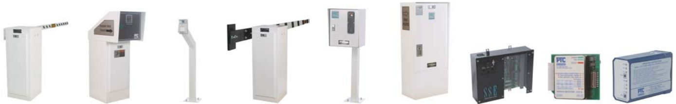
AG50/SSE Auto Gate